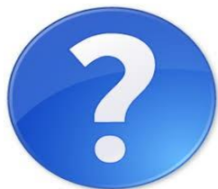
Scanview Quick Doc

Information about Scanview can be found in the user's guide on pages 10-18 and on the Quick Doc below. The guide provides tips on how to resolve scanning errors such as omitted or incorrect student IDs. Scanview is only available to those individuals having administrative access to the Performance Matters Testing Platform.