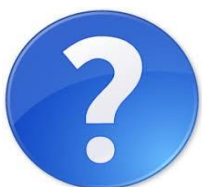
Scoreboard Quick Doc