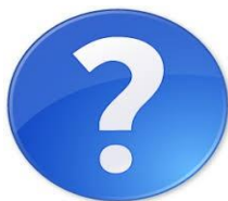
OLA Quick Doc

The OLA Student Administration screen should be carefully monitored to ensure that students have completed the entire testing session(s) from Unassigned to Finished. Refer to the Performance Matters Quick Doc below for detailed information on the OLA Student Administration.